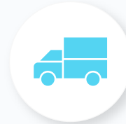
Urban Delivery Service