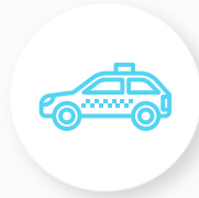
Online Ride Hailing