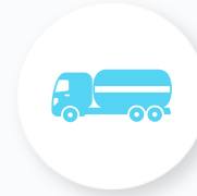
Oil & Gas Trucking