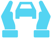
Usage based Insurance