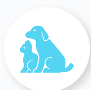
Pets, Farm Animals