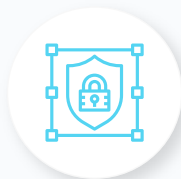
Offices & Bank Security