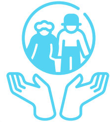
Elder Care Services