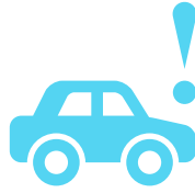
Stolen Vehicle Recovery